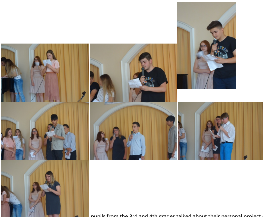
pupils from the 3rd and 4th grades talked about their personal project experiences

Then a photo show took the guests to the different partner cities of "The City we live in, the City we want to live in in 2020" and gave some impressions of the great experiences that all the participants had together.