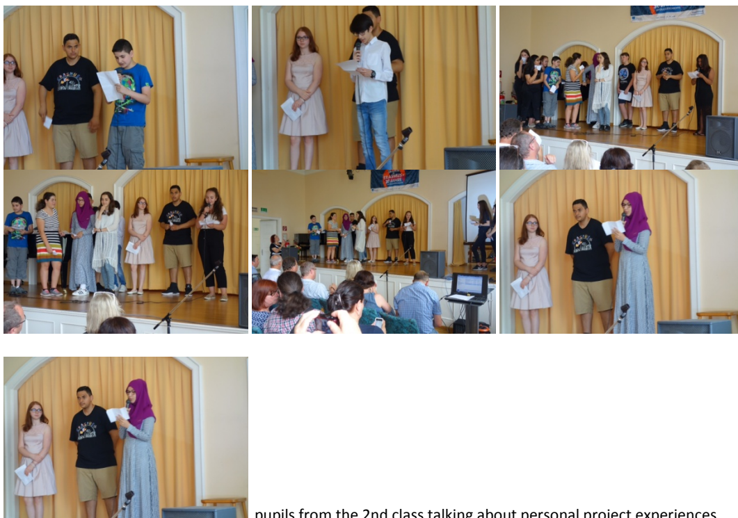
pupils from the 2nd class talking about personal project experiences

Afterwards, pupils from the 2nd class told about personal project experiences and what they liked best about the project "An Artistic Trip around Europe".